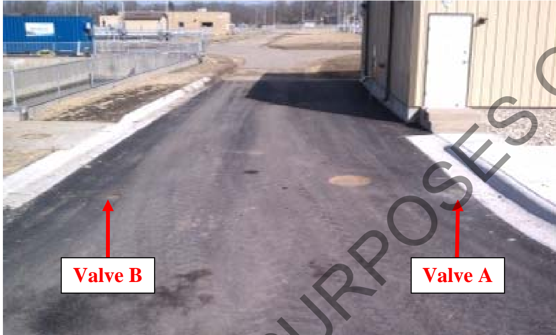
FIGURE 1: Spill Containment Valve Locations