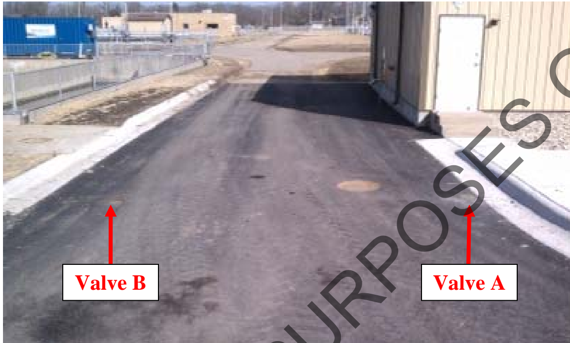
FIGURE 1: Spill Containment Valve Locations